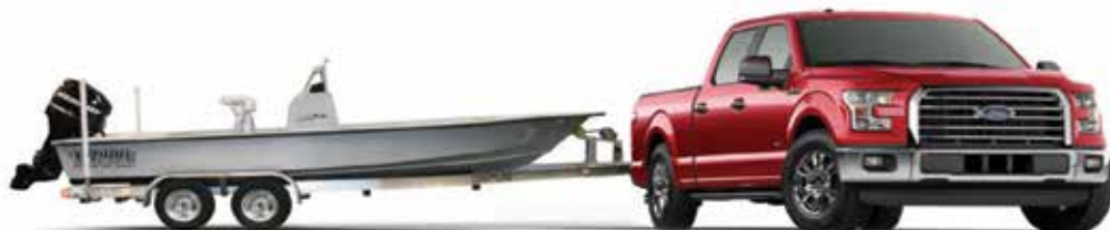
2016 Ford F-150 "Texas Edition" XLT SuperCab with Haynie 23 Bigfoot, the Redfish Division prize.

SPECIAL BONUS FROM ACADEMY SPORTS & OUTDOORS - ATTENTION CURRENT CCA TEXAS MEMBERS! Chances are you've received your $10 gift coupon from Academy Sports + Outdoors just in time for the STAR kick-off! Special thanks to Academy Sports + Outdoors for continuing to make your CCA membership and STAR entry such an awesome value!