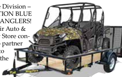
Offshore Division Prize - Polaris Ranger® Crew 570 EPS

Offshore Division - ATTENTION BLUE WATER ANGLERS! Hoffpauir Auto & Outdoor Store continues to partner with us to provide the offshore angler something that will come in