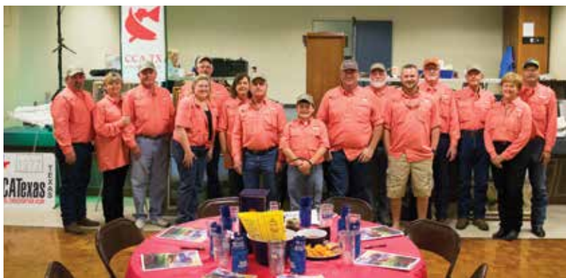
Colorado Valley banquet hard workers.

Our chapter would like to again extend our sincere appreciation for the continued support of Capitol Wright Distributing and Brown Distributing with their generous donations to the evening along with our cap sponsors, J&J Metal Works, Inc. , LakeView Glass and Mirror , and Oviedo Chrysler Jeep Dodge