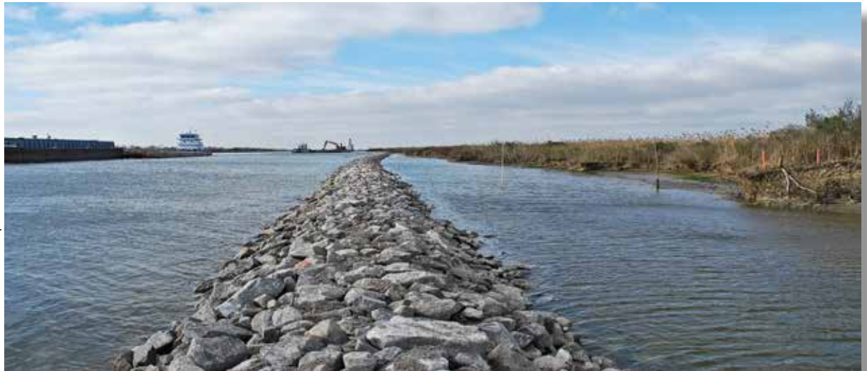
J.D. Murphree breakwater protection site near Port Arthur, February 2014.

Founded in 2010, BCT is the national habitat program of Coastal Conservation Association designed to provide the means for