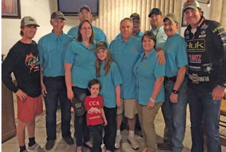
The Orange County Redfish Elite group.

Thanks to the girls from High Profile Promotions for selling the $5 tickets, $300 package tickets and the $500 package which included the drawing for the Polaris and other gifts. The winner of the Polaris was John ( Bull