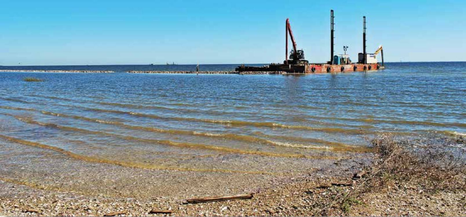
The final phase of construction at the Oyster Lake Shoreline stabilization site in West Galveston Bay, November 2015.

communities on the value of conservation.