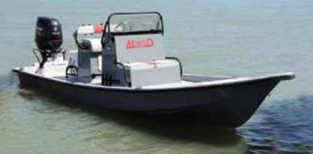
All NEW Trout Division Prize - the Mowdy 22' V

Trout Division - ATTENTION TROUT ANGLERS! We are thrilled to announce an ALL new prize offering for this division! Winners in the upper, middle, and lower coast regions will each take home the legendary Mowdy 22' V boat with a Suzuki DF150 motor and Coastline trailer. The 22' V hull design is the perfect boat to handle shallow and rough water and remain completely dry. Mowdy fishermen know that the V-Hull is the most versatile hull on the market. With its 8" draft, the Mowdy gives you all of the best that a fishing boat has to offer. In true Mowdy heritage, the 22' offers everything that you expect from the Mowdy name. FRIENDLY REMINDER... If you're unsure a trout is large enough to qualify, consider this "easy rule-of-thumb" - if length is less than 27 inches, chances are it won't meet the eight pound minimum weight requirement for the Trout Division. Unless you intend to mount your fish as a personal best, why not think about releasing anything that might not make the cut so she can re-seed the bays.