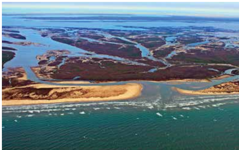
Aerial photo of the opened Cedar Bayou, March 2016.