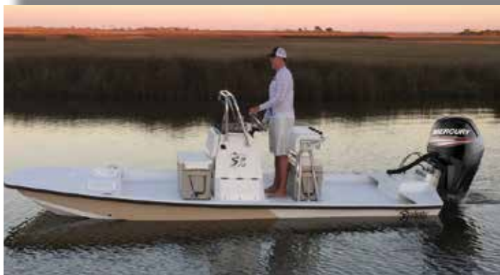
Inshore Division - Shoalwater 19' Cat boat with a Mercury 115 ELPT 4S motor

Inshore Division - ATTENTION INSHORE ANGLERS! We have an exciting new, versatile Inshore Division Boat Prize for 2016! Winners who land the heaviest flounder, sheephead and gafftop will each take home the awesome Shoalwater 19' Cat boat with a Mercury 115 ELPT 4S motor and McClain trailer. The 19' Shoalwater Cat floats and runs shallower due to less deadrise in the bow and less weight resulting in an excellent ride