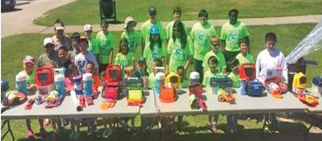
The Northwest Annual Kid Fish in La Porte was another great success.

We held our Second Annual Chapter Banquet at the Sam Houston Race Park on March 24th. I'm pleased to report the banquet was a resounding success, not only for CCA Texas, but for all the vendors, suppliers, and homebuilders in attendance! Word has gotten out that this is one of the best networking opportunities that the Houston homebuilding industry has to offer, and that fact was reflected in the nearly sold out crowd at the Race Park!