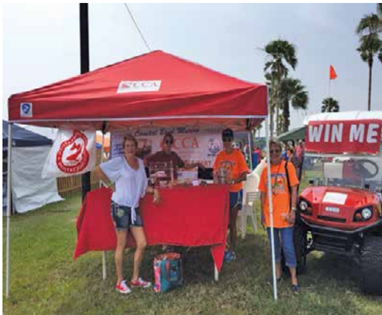
The Port O'Connor crew with the 2016 banquet Golf Cart.