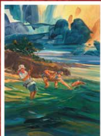
"Good Morning Cedar Bayou" © Sam Caldwell

CCA Membership and STAR registration included with your purchase.