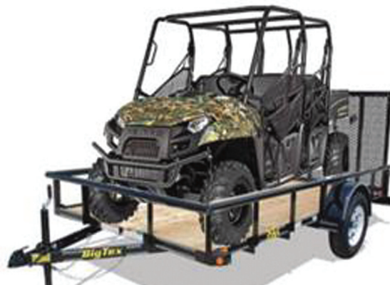
San Bernard's Polaris Ranger 570 Crew