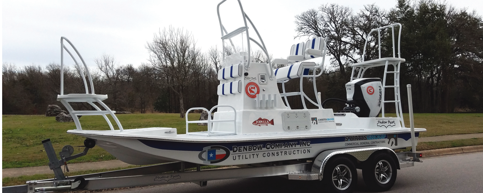
Austin's 2017 Shallow Sport Classic, with an Evinrude E-TEC G-2 175HP outboard.