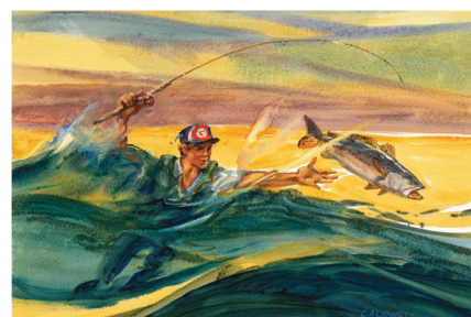
"SCHOLARSHIP ON THE LINE"

Proceeds from the sale of these limited-edition packages will help us continue to fund the STAR scholarships.