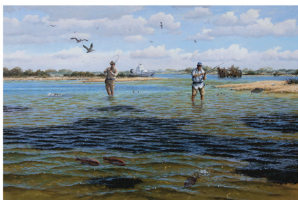
"IT'S ON"