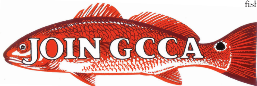
The first GCCA logo as a bumper sticker.

As we all know it is important to be able to get our message and accomplishments out to