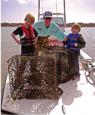
For complete Abandoned Crab Trap information— see page 6

The 22nd Billy Sandifer Big Shell Beach Cleanup will be held on the Padre Island National Seashore on Saturday, the 25th of February. Volunteers will meet at the Malaquite Pavilion park-