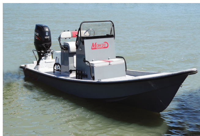
Trout Division Prize: Mowdy 22' V boat with a 150 HP motor and Coastline trailer.

Trout Division - ATTENTION TROUT ANGLERS! After years of requesting a more versatile boat prize in this division, we heard you! This year winners in upper, middle, and lower coast regions will again each take home the awesome Mowdy 22' V boat with a 150 HP motor and Coastline trailer.