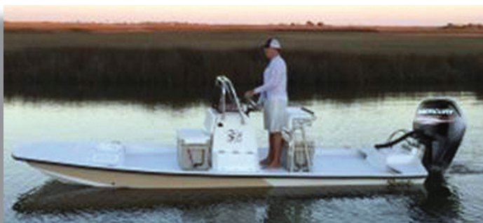
Inshore Division - Shoalwater 19' Cat boat with a 150 HP motor and McClain trailer

Inshore Division - Each winner who reels in the largest flounder, gafftop and sheepshead will be handsomely rewarded with a Shoalwater 19' Cat boat with a 115 HP motor and McClain trailer.