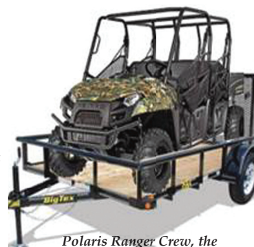
Polaris Ranger Crew, the STAR Offshore Division first prize.

continues to partner with us to provide the offshore angler something that will come in very handy after a long trip on the high seas. Anglers who land the heaviest kingfish, dorado and ling will each receive an awesome Polaris Ranger® Crew 570 EPS UVs in Polaris Pursuit Camo each with a Big Tex 35sa Trailer!