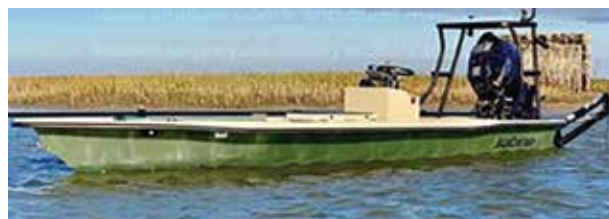
Central Houston's Sabine Skiff