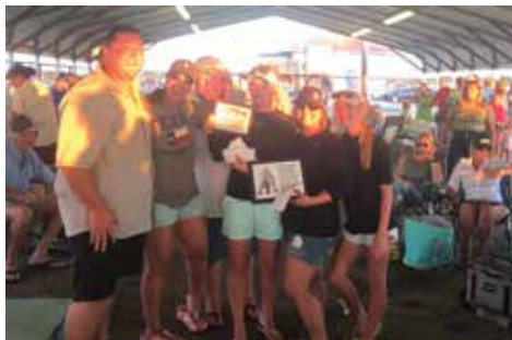
A few winners at Fort Bend's 2019 Lingerie on the Bay.

Summer is finally coming to a close and to recap, the fishing this year has been amazing. The group has been active on the water and we have made several fishing trips, despite the heat, and have not been disappointed. I have never seen or heard of such good