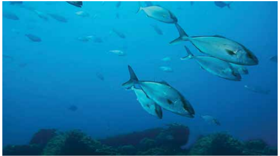
Cover photo and this photo by Curtis Hayungs. Images capture the rapid coral growth on recently deployed concrete railroad ties.

Freeport's Vancouver nearshore site was the first site CCA Texas was involved in.