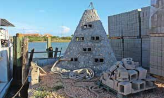
Pyramid reef and other concrete objects being readied for deployment.

reefing site. This site is the largest ever permitted in the state of Texas and FRGVR is setting the bar high in effort and the amount of materials that have been deployed into the site. To date the material deployments have been numerous and include 50 plus reefing pyramids, over 87,000 cinder blocks, low relief concrete rubble, and a shrimp boat and tugboat have been deployed into this reefing site. Concrete railroad ties have been used to create a 500' long ridge that is 10' to 15' high throughout the length of the ridge and is located in the "CCA Corner." Additionally, a 32' tall "Mountain" has been built in the site from railroad ties as well.