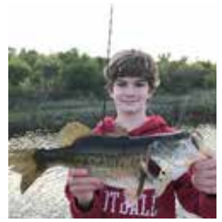
Dallas chapter kids training for the bay on largemouth bass