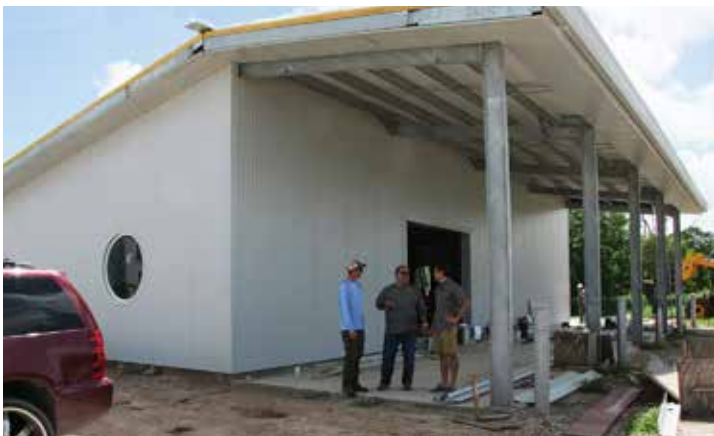
A place of their own... the CCA Texas flounder Building at Sea Center Texas was designed to fit the special needs of flounder stock enhancement.

Vice-Chairman Aplin's pledge for the department to ramp up stocking efforts of southern flounder should come to fruition in late 2020. The CCA Texas flounder building at Sea Center Texas in Lake Jackson is nearing completion and the sister building in Corpus Christi is already online. With the two new buildings, Texas Parks and Wildlife staff will be capable of expanding their flounder spawning and fingerling grow-out into warmer months, giving them two rounds of production.